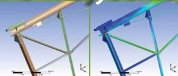
3D Computer analysis of loads and stresses on the Valley drive unit.