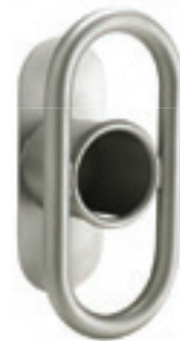
Wall and Ellipse Hose Bracket